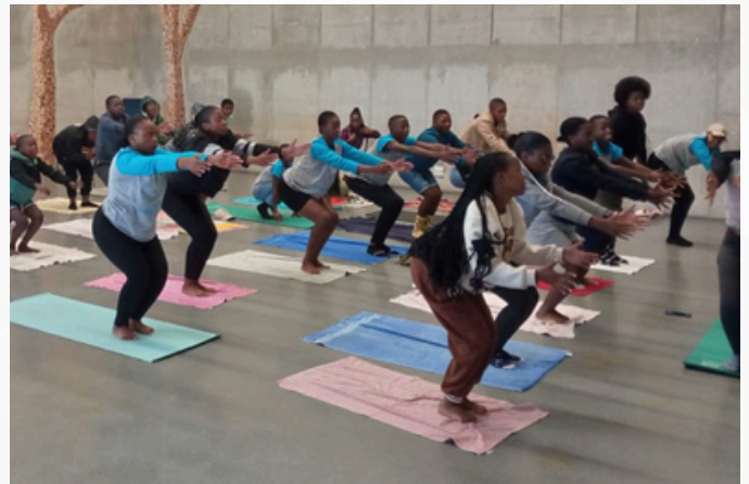
YouLead Warriors being guided in their weekly yoga session