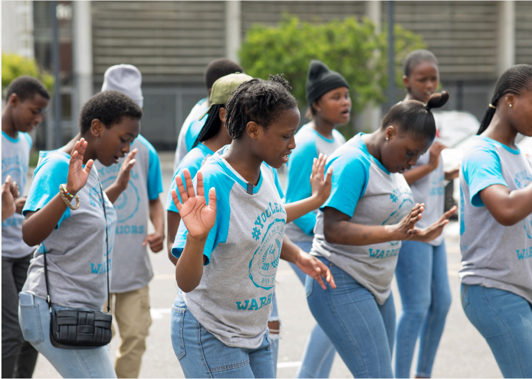
YouLead Initiative 2024 end of year celebration