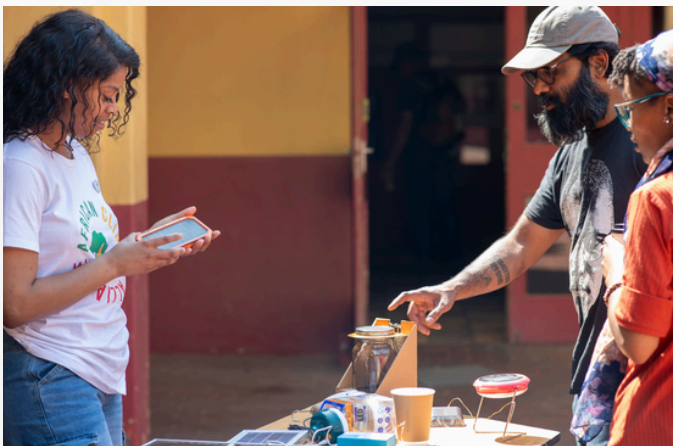
Project 90 by 2030 energy desk demonstration for community and youth activists