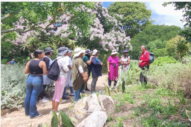
Community leaders coming together to embrace nature and build a deeper appreciation to the environment