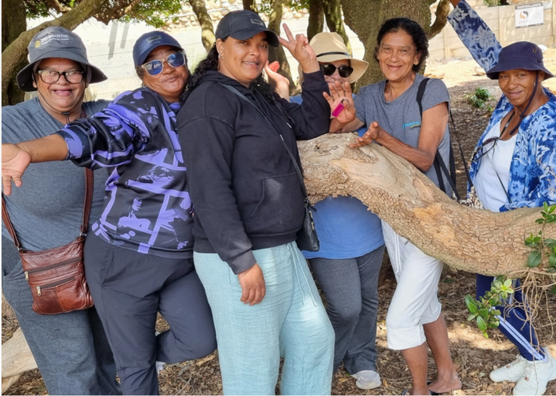
Hanover Park community energy and climate democracy activists at end of project celebration