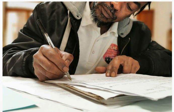
Community activists drafting energy and climate justice policy submissions