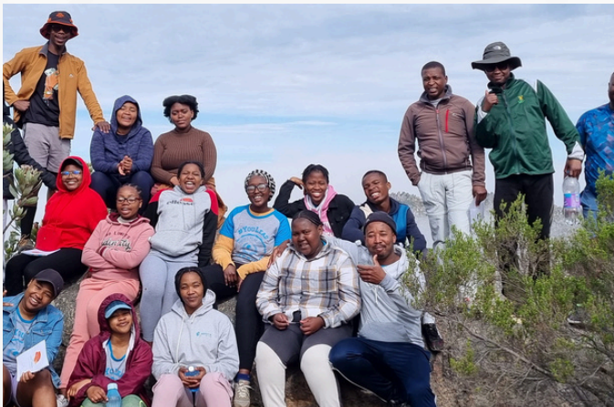
Overnight adventurous journey with Educo Africa