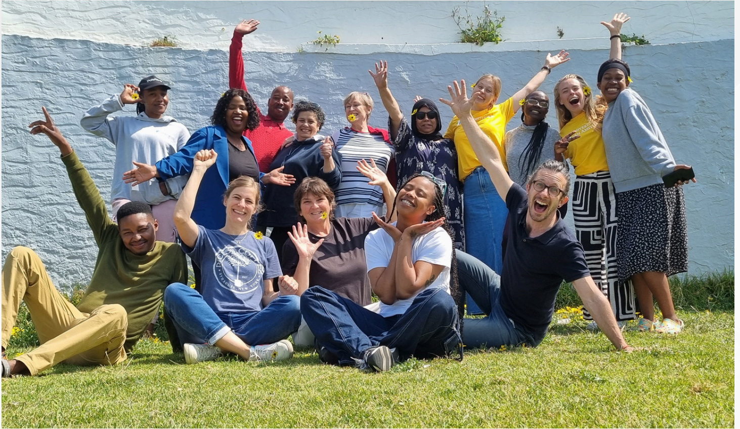
Project 90 by 2030 Team Photo in Muizenberg

YOU ARE NOT JUST A DROP IN THE OCEAN WE ARE THE WAVE OF CHANGE!