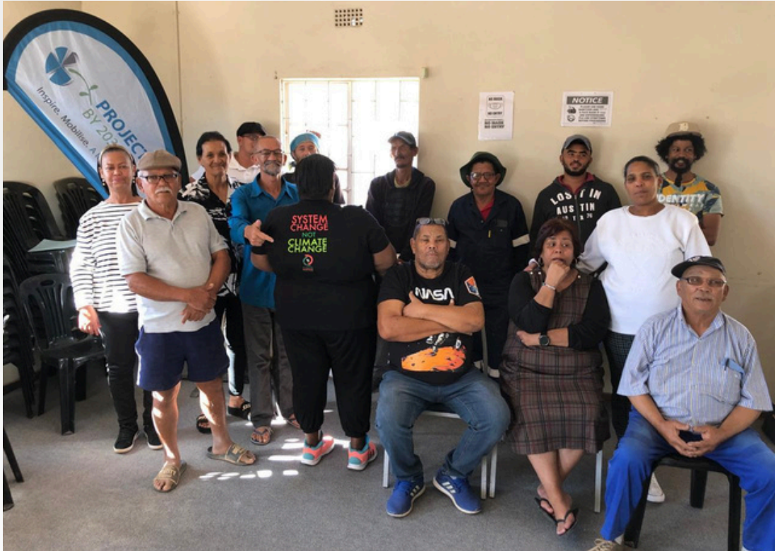
Northern Cape community activists at just energy transition capacity building community workshop